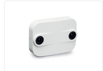
PC2R with WiFi-Module

Power over Ethernet (PoE) to combine data connection with power in one cable and a Mean Time Between Failure (MTBF) of 25 years simplify installation and keep the total cost of operation low. Image processing occurs directly on the sensor. No video stream leaves the sensors and data privacy is guaranteed. The Xovis portfolio includes a model with wireless functionalities as an add-on, though the Xovis technology does not depend on signal-emitting devices and is highly robust against all kinds of external influences such as shadows, light changes, and heat emissions.