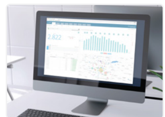
sensalytics KPIs dashboard integrating Xovis data